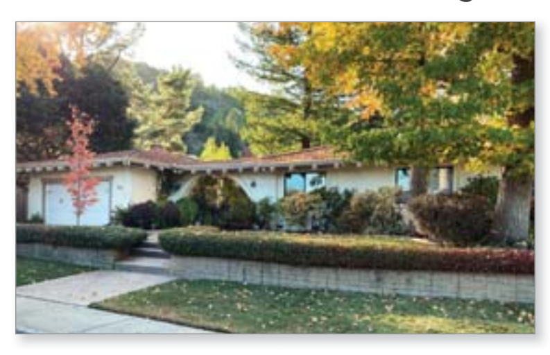
Listed for $1,780,000, Sold for $1,815,000 Single-story expanded rancher on a cul-de-sac with pool and updates throughout. 4 bedrooms plus office. The perfect tranquil retreat.